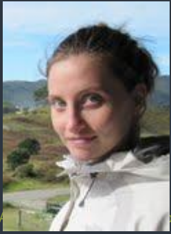
Former Grassroots co-ordinator)

"In 2009/2010 I was a Grassroots coordinator for UCLSHRP while doing my masters in Human Rights. The Grassroots initiative gave me the opportunity to put my newfound knowledge into practice by teaching children about human rights. Spreading awareness of human rights is the first step in ensuring that they are respected, so by encouraging young people to think about their rights I felt that we were making a difference. This experience put me in a position to work on a workshop for the Human Rights Watch Film Festival, as part of their Youth Producing Change programme. It has been inspiring to work with creative young people who want to engage with human rights issues, and to be in a position to help them make their voices heard. I am currently doing the Graduate Diploma in Law, whilst working on the Human Rights Watch Film Festival. Next year I will be starting the Bar course and seeking to attain pupillage in a civil liberties set, or a position in an NGO working on human rights issues."